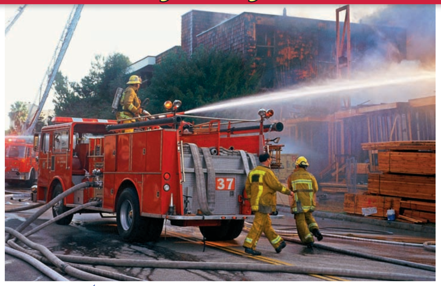
I have a big responsibility.