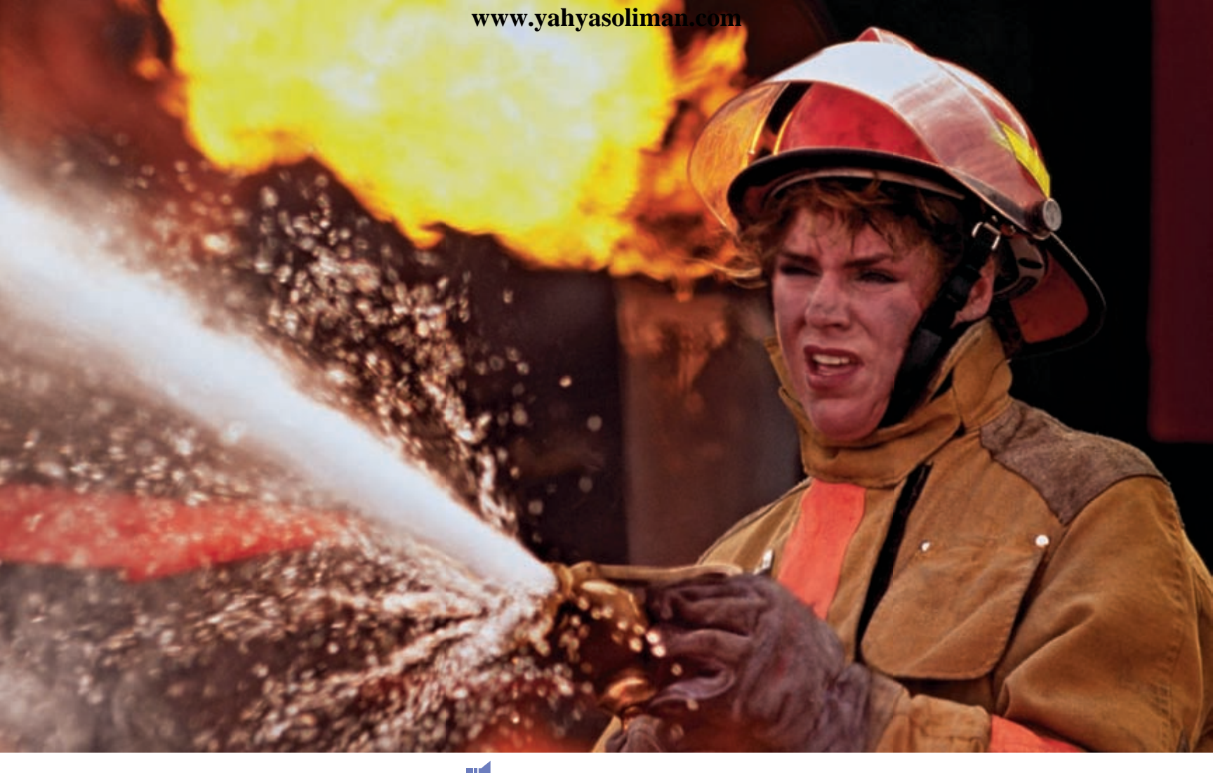
I fight fires.