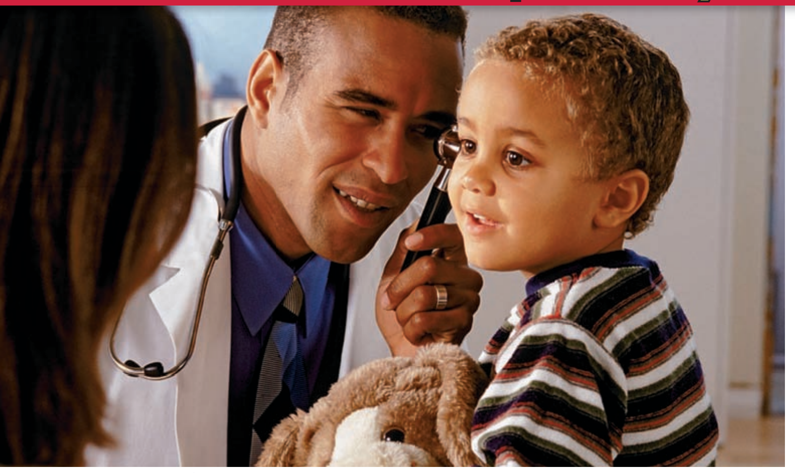
You see me when you are sick.