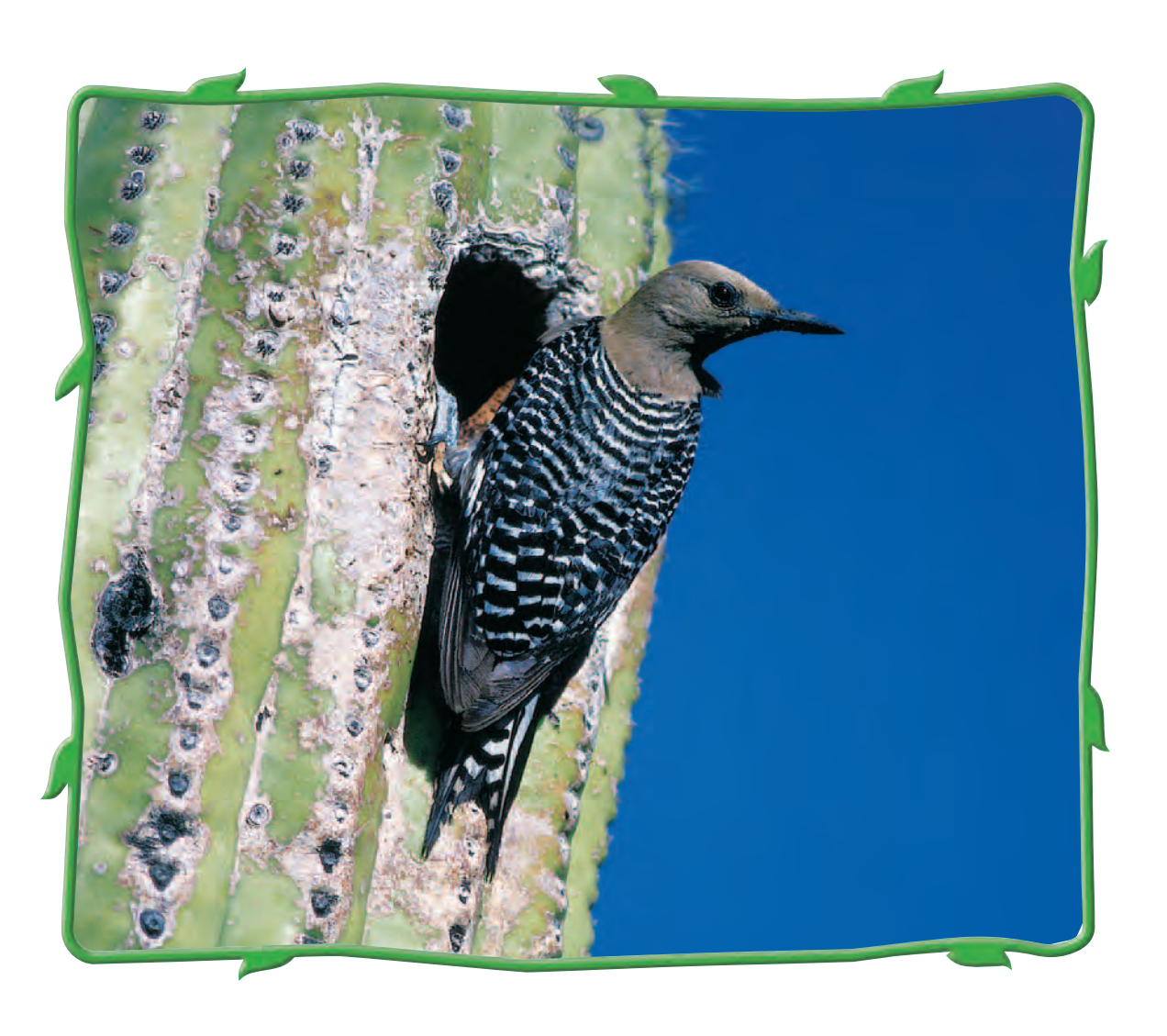
A bird lives here.