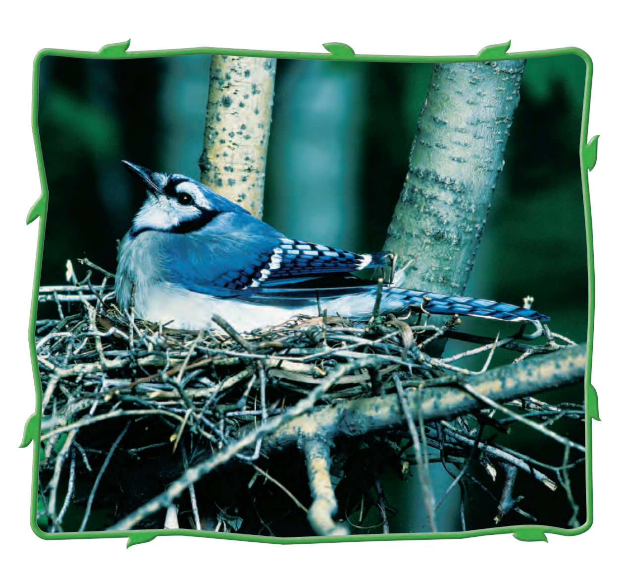
"A bird lives here, too.