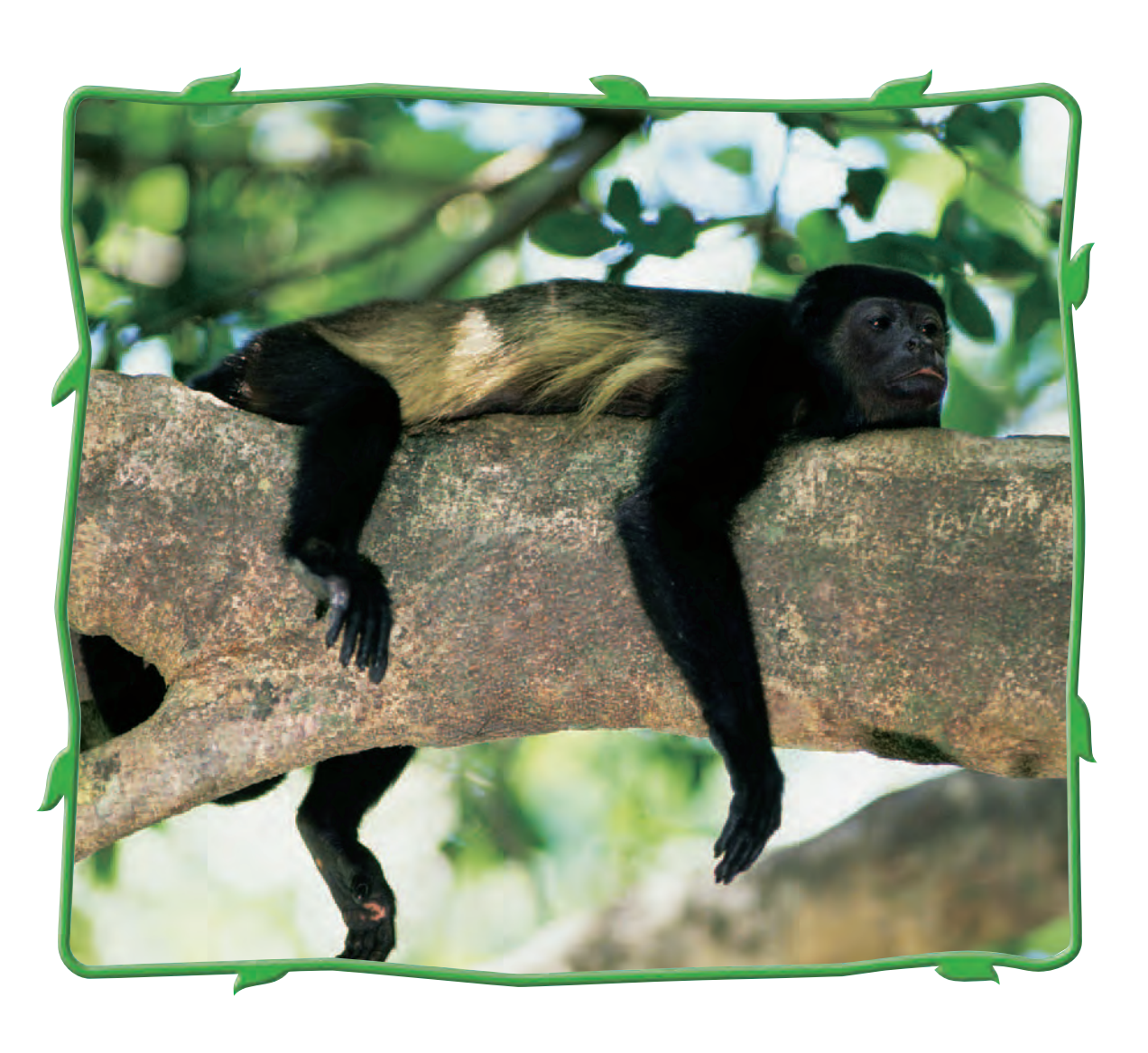
So does this monkey.