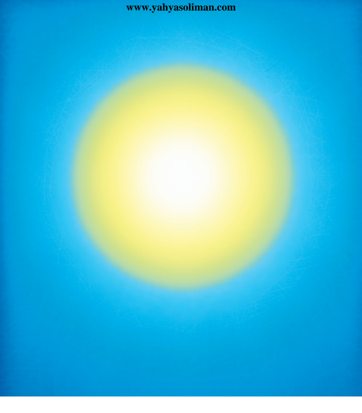
The sun shines.