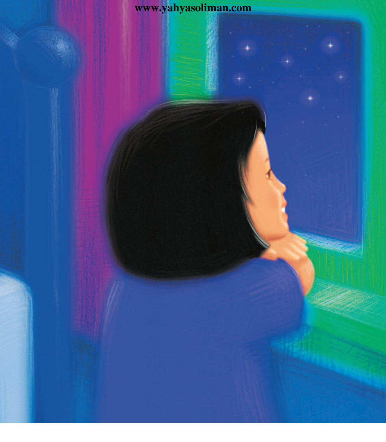
■I like night, too.