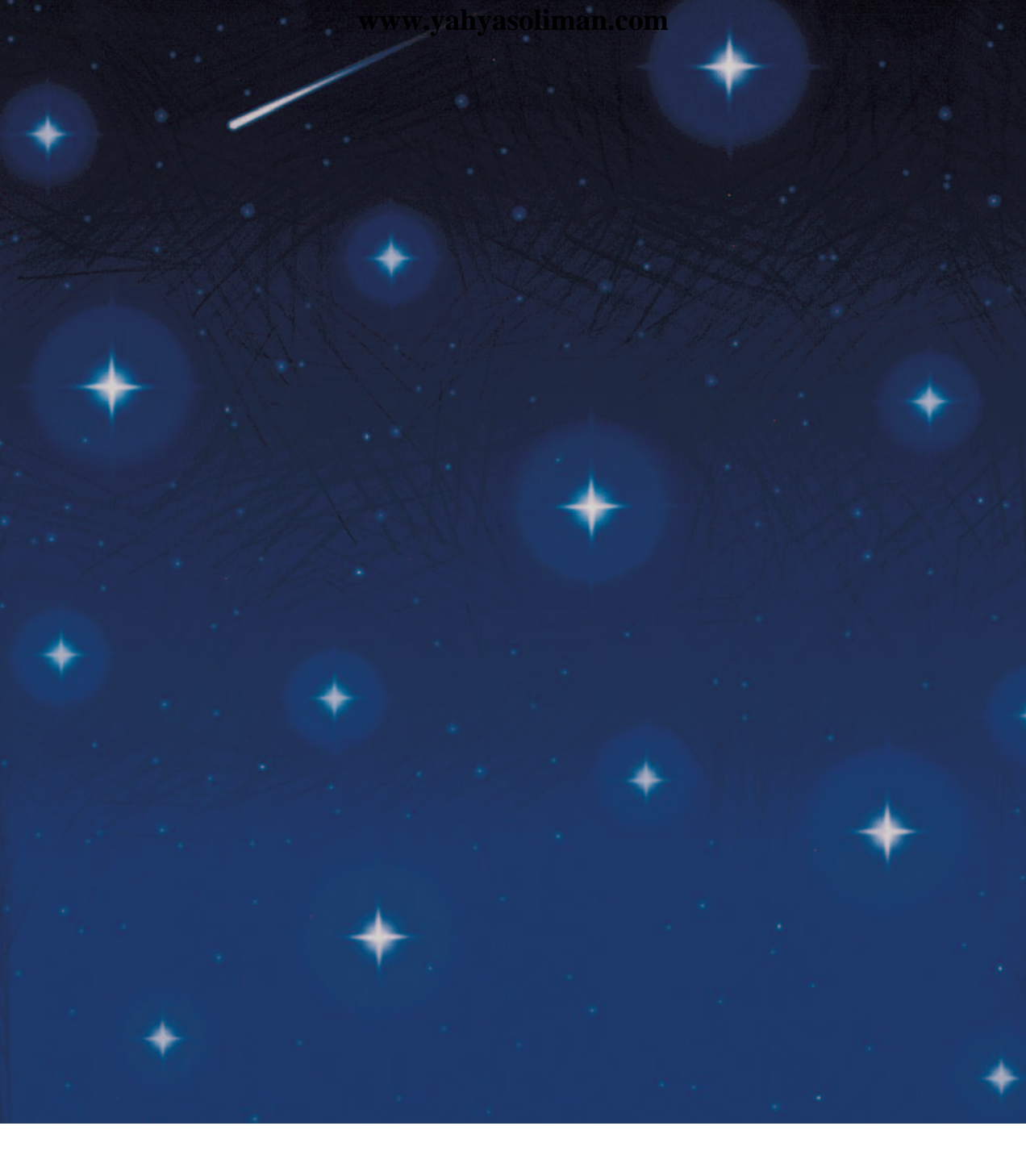
The stars shine.